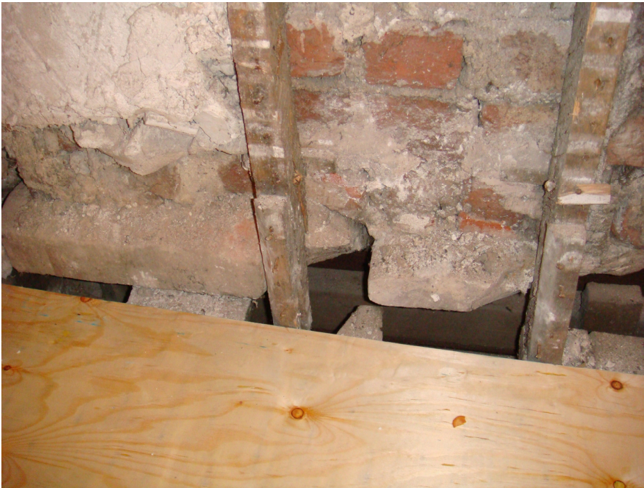
Photo 37B - Steel beam / wall support arrangement along front façade