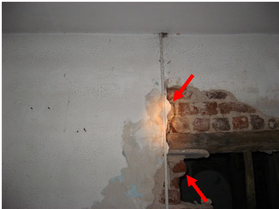
Photo 27 - Vertical crack over doorway in the intermediate wall and damaged reveal