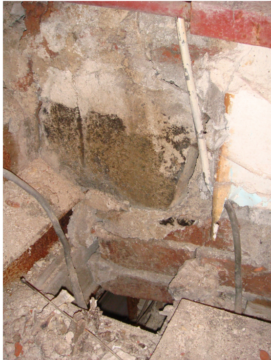
Photo 21C – Evidence of downward movement of intermediate wall relative to facade