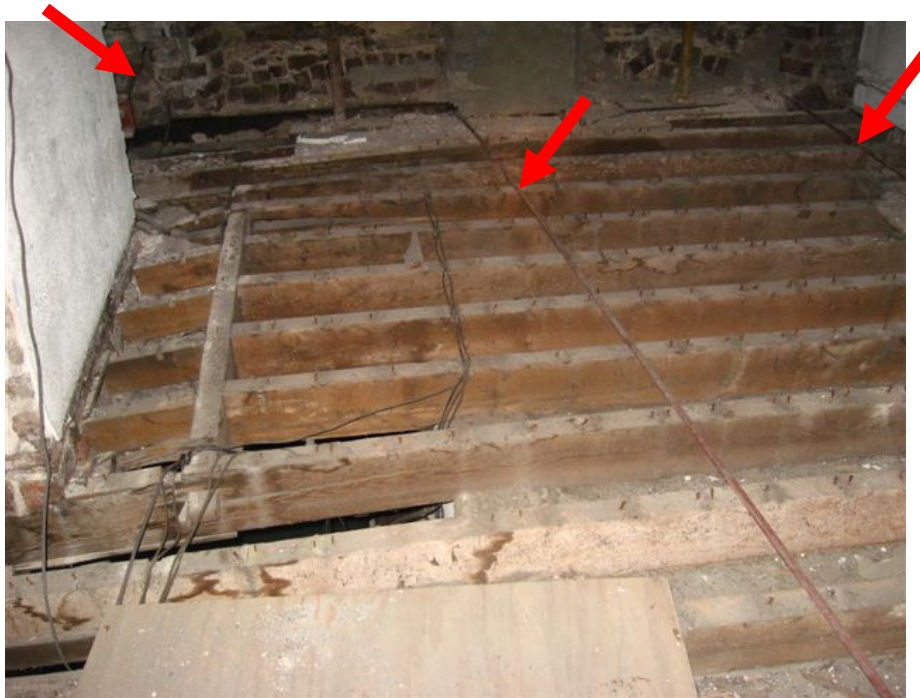
Photo 24 – 1 st Floor front left side room tie rods & disruption to floor joists