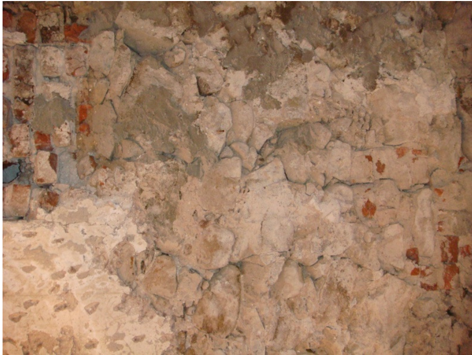
Photo 19B – Random nature of party wall between property numbers 1 & 3.