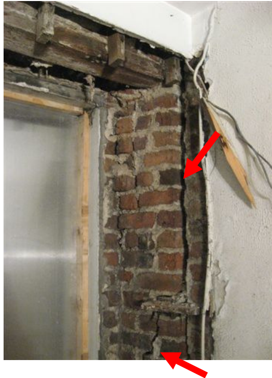
Photo 21A – Gap between intermediate wall and front façade. Diagonal crack in the reveal approx 4-5mm wide.