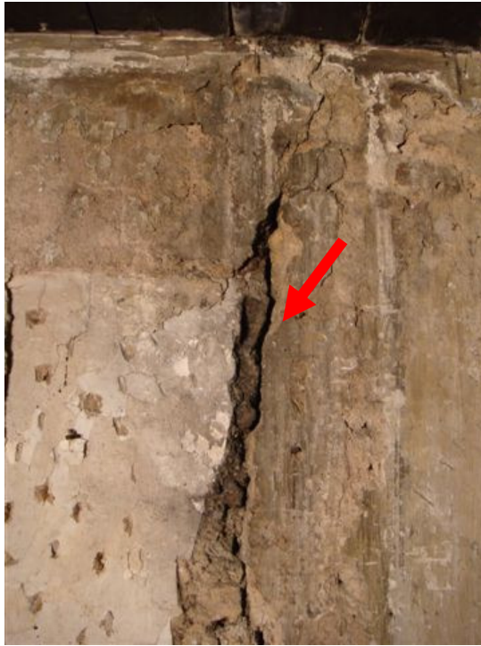
Photo 10 – Vertical crack approximately 5mm wide to LHS of chimney breast