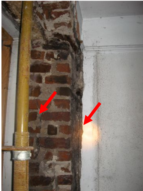
Photo 29A – Vertical crack at junction of party wall between property number 3&5 and vertical crack in front wall right window opening.