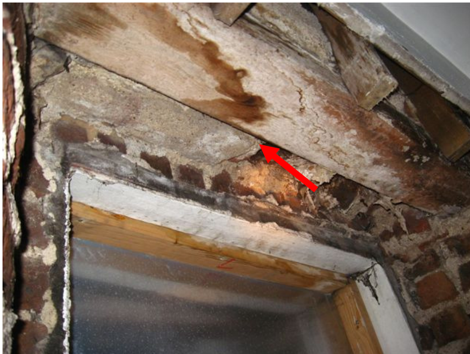
Photo 20 – Front façade – middle leaf not supported & decayed head