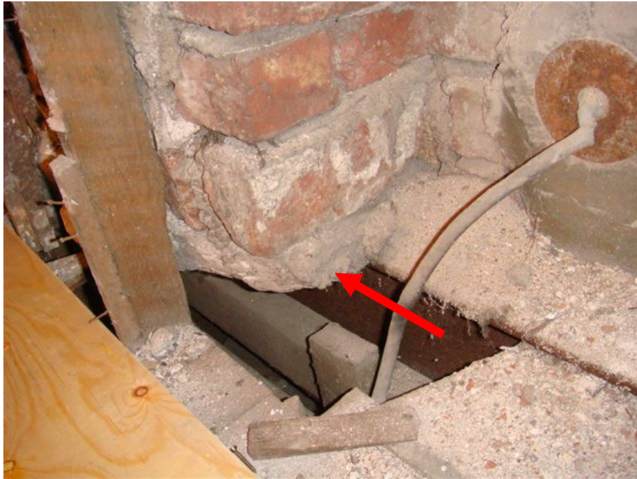
Photo 38 - Steel beam / wall support arrangement along front façade