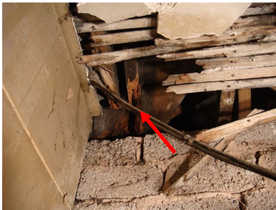
Photo 6 – Damp and rot in existing building rafters at intermediate wall location