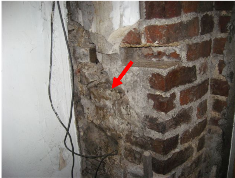
Photo 28 – Diagonal shear cracking in wall above the tension ties.