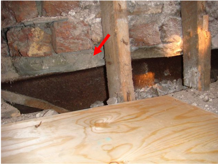
Photo 37A - Steel beam / wall support arrangement along front façade