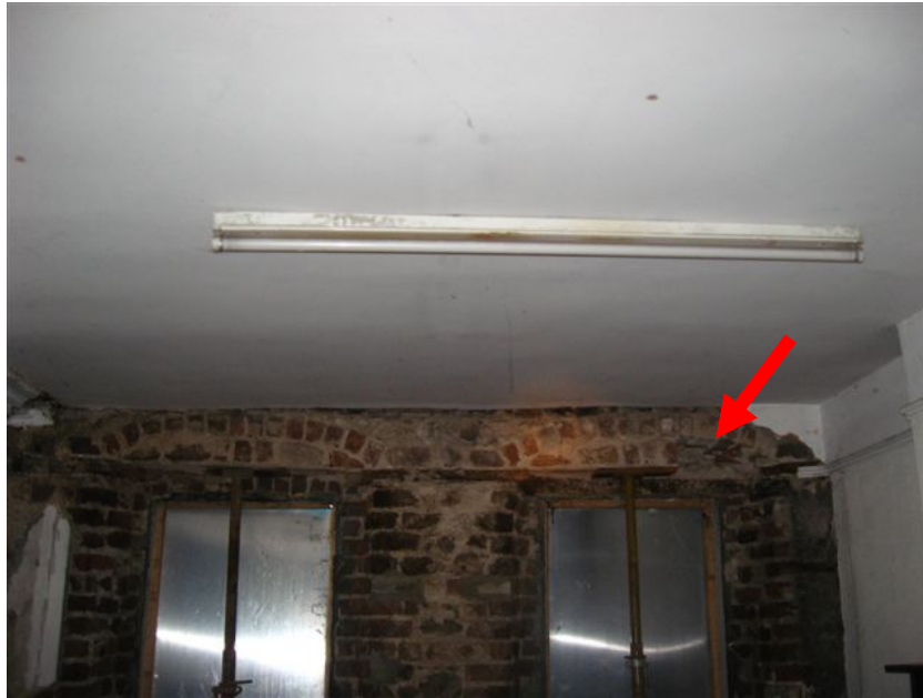
Photo 25A – Missing brickwork at RHS window where additional prop was installed.