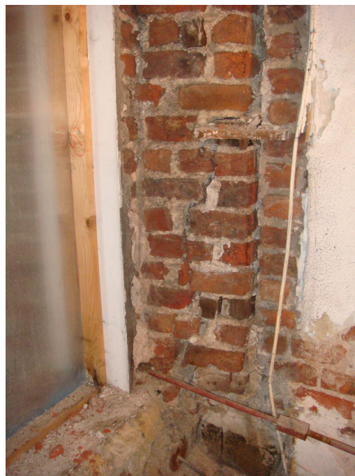
Photo 21B – Gap between intermediate wall and front façade. Diagonal crack in the reveal approx 4-5mm wide.