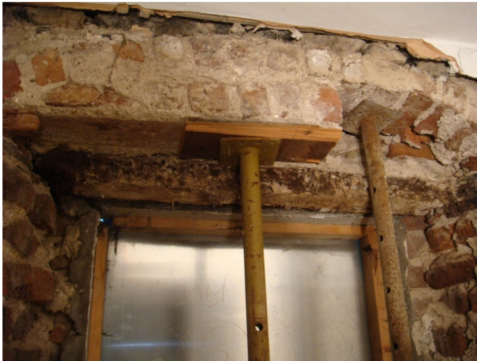
Photo 25B – Missing brickwork at right side window & complete loss of timber head